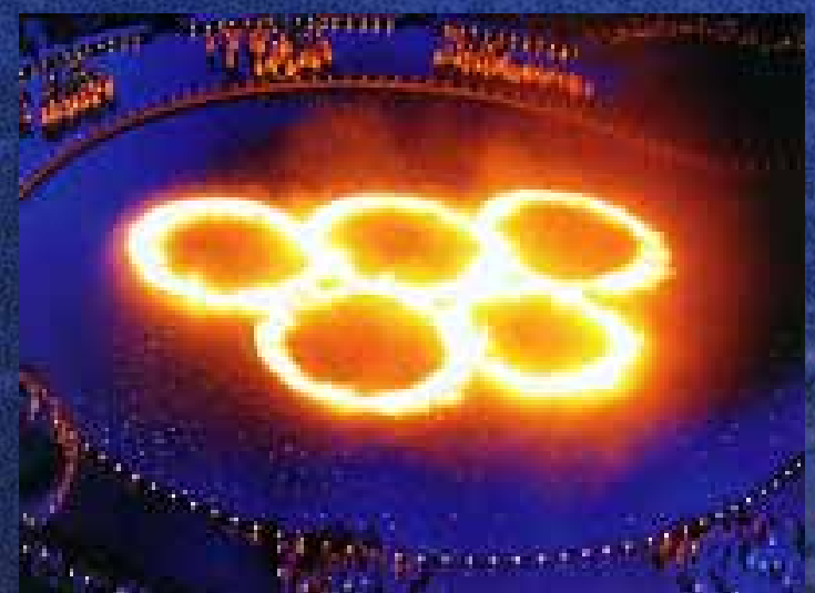
Olympic Winter Games in Salt Lake City in 2002 – Pierre de Coubertin put emphasis on the opening- and closing ceremony of Olympic Games. This tradition still exists today.

" With the advent of the IV Olympiad, it became advisable to consult one another on how to study to what extend and in what form the Arts and Humanities could participate in the celebration of the modern Olympiads and, in general, join in the sports to benefit from them and to ennoble them."