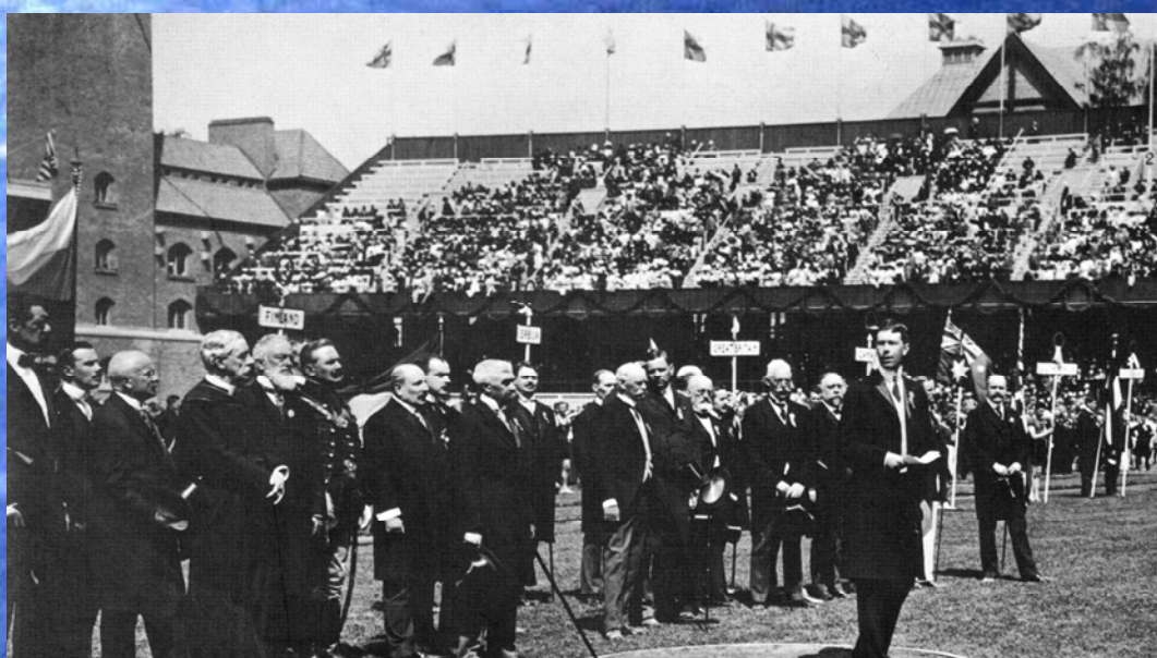
Opening Ceremony of the Olympic Games in 1912 in Stockholm

" With the advent of the IV Olympiad, it became advisable to consult one another on how to study to what extend and in what form the Arts and Humanities could participate in the celebration of the modern Olympiads and, in general, join in the sports to benefit from them and to ennoble them."