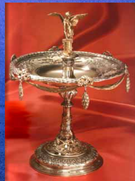
The Olympic Cup designed in 1906 by Coubertin.

"Music has its place marked in the sports events and, admittedly, until now its place remained almost empty. Aside from the « marches », « the songs of victory » and the « fanfare » which will always be enclosed more or less in a limited rhythm, why would not come the day when we would have from some Scandinavian fjords, a « winter symphony » where the ski events would take place melodically?"