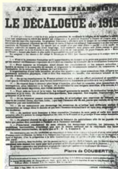
Coubertin, "A 1915 Decalogue: To the Youth of France"