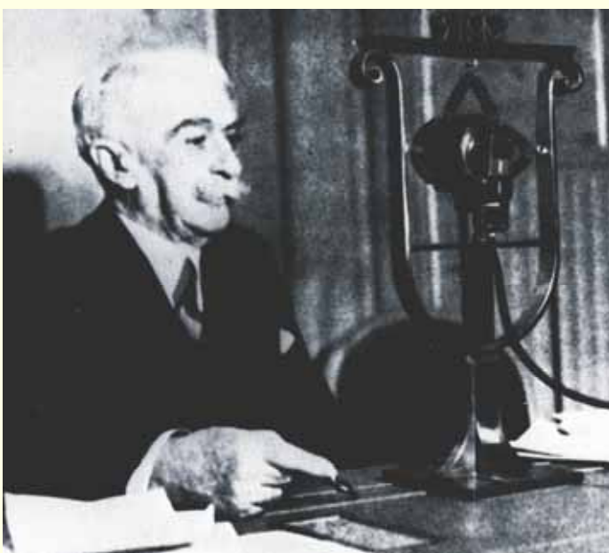
At a radio broadcast to the American youth in 1934.

In 1890 Coubertin calls for a radical reform of the educational system. He says that "no political, economic or social reform can be fruitful without first a reform of pedagogics" .