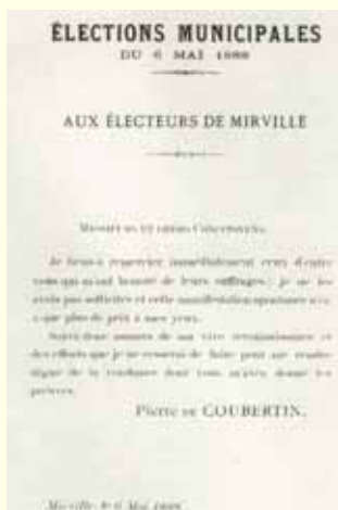
The Municipal elections on May 6 th 1888 for the citizens of Mirville

In 1925 he founded the Universal Pedagogical Union, the results of which – written in four different languages – cause a sensation due to originality and realism.