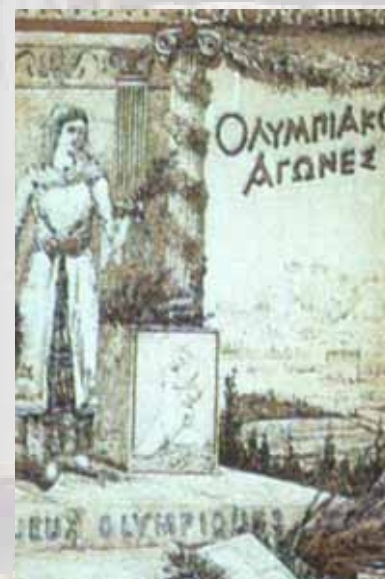
Poster of the first Olympic Games of modernity