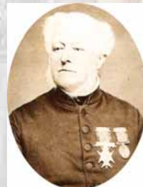
Dr. William Penny Brookes