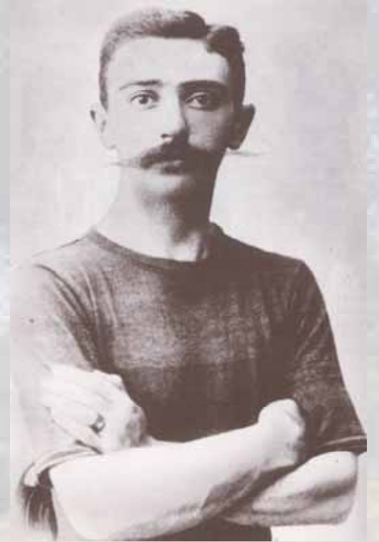
The young baron

Dr. William Penny Brookes - a country doctor of the English town Much Wenlock with manifold interests - who had already been organizing the Wenlock Olympian Games in regional standard since 1850, had an especially important influence on Coubertin .