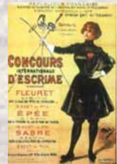
Poster of the Olympic Games 1900 in Paris

In Olympia, on the peninsula Peloponnes, Olympic Games took place over 2500 years ago. The first Games took place in 776 BC and Heracles is said to be the founder of this movement. Heracles, Zeus' and Alkmene's son, is said to have killed two poisonous serpents soon after his birth, who were sent by Zeus' jealous wife Hera. In the following time Hera succeeded in driving her stepson insane, so that he even killed his own children. He had to atone for it by serving King Eurystheus, who gave him 12 tasks he had to fulfil. So Heracles had to beat the lion of Nemea and the nine-headed, people-eating giant serpent Hydra. On this day he also cleaned the massively dirty stalls of King Augias by leading two rivers through the stalls. Thereby he came into a fight with the King, which Augias didn't survive. Thereafter Heracles is said to have founded the Olympic Games. The Games ought to be there for all Greeks and guarantee the participants' and spectators' security for travelling there and returning home again as well as for the duration of the Games. These Games had their climax in the 5th and 4th century B.C. In 393 A.D. they were forbidden by the Roman Emperor Theodosius I for being a pagan cult.